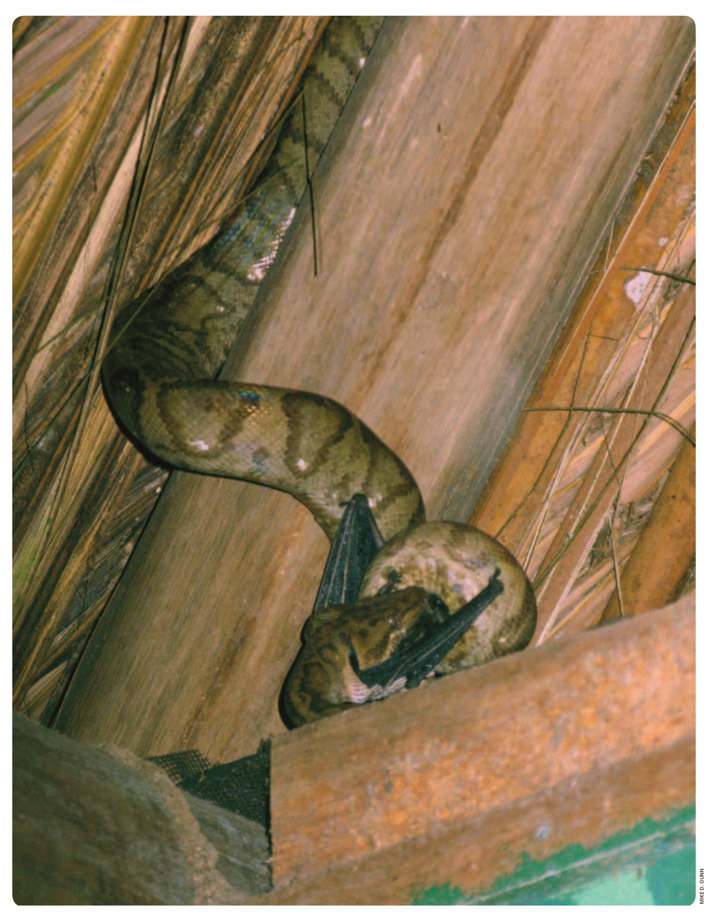
Corallus annulatus from the Caño Palma Biological Station consuming what is likely a Brazilian Long-nosed Bat (Rhynchonycteris naso).