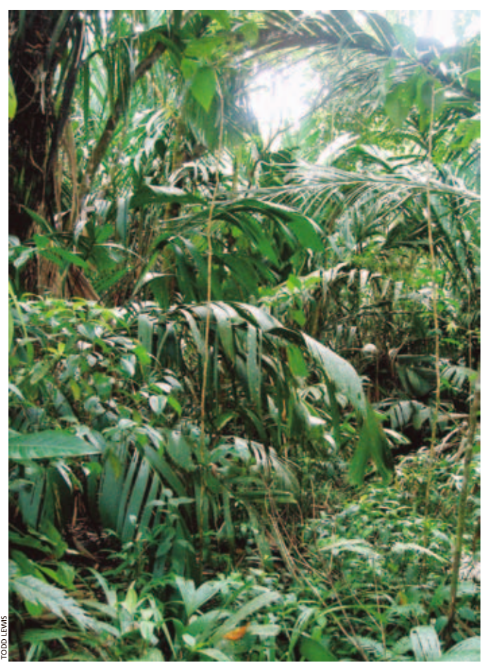
Fig. 7. Typical Manicaria palm swamp forest, dominated by Palma Real ( Manicaria saccifera ), at the northern section of the Caño Palma Biological Station's forest.

were adults and three were juveniles. Mean SVL of males was 749.6 \pm 81.1 mm (198–1,020 mm) and for females 700.3 \pm 107.8 (180–1,434 mm) (Fig. 8). We found a female of 1,434 mm SVL and 1,544 mm total length, very close in size to the largest known individual, also a female, of 1,447 mm SVL (1,725 mm total length) from Guatemala (Smith and Acevedo 1997). Mass varied between 27 and 448 g. Total length, SVL, and mass were all positively correlated ( r_{s} = 0.789, 0.955, 0.913; P < 0.05).