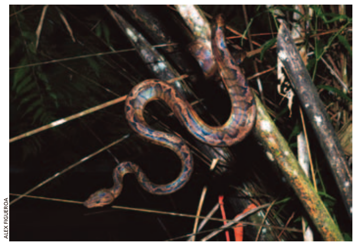
Fig. 1. Corallus annulatus in a palm (Raphia taedigera) at the Caño Palma Biological

Caño Palma Biological Station's climate has average daily temperatures of 26 °C (23-32 °C) and 70% RH (60-95%). The region is subject to the