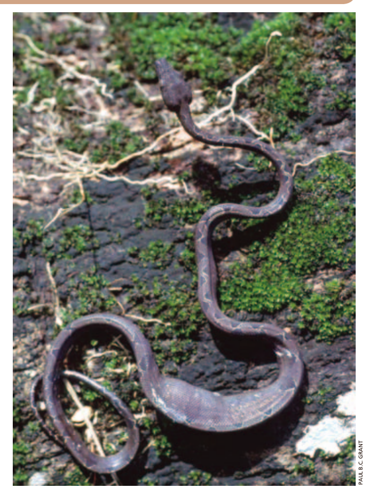
Fig. 2. Corallus annulatus from the Caño Palma Biological Station after consuming

customary wet (September-February) and dry (March-September) seasons of the Neotropics, but is often affected by onshore weather and storms from the Caribbean Sea. The Caño Palma area has highly unpredictable annual rainfall that can exceed 6,500 mm (Lewis 2009). Over 100 cm of rain over the course of a few days, resulting in temporary flooding of the station and its grounds, is not unusual. Such abundant and serious rainfall in a known lowland catchment area creates a habitat that is very wet, botanically diverse, and unusually dominated by palms (Manicaria saccifera, locally known as "Palma real"), resulting in a lowland tropical wet forest on risen terrain (Myers 1990, Lewis 2009, Lewis et al. 2010).