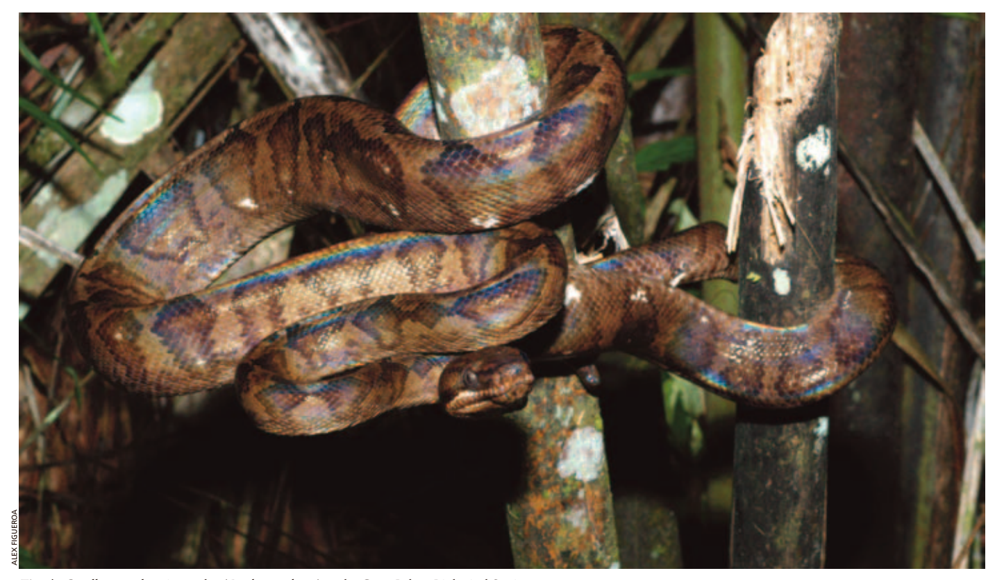
Fig. 4. Corallus annulatus in a palm (Raphia taedigera) at the Caño Palma Biological Station.