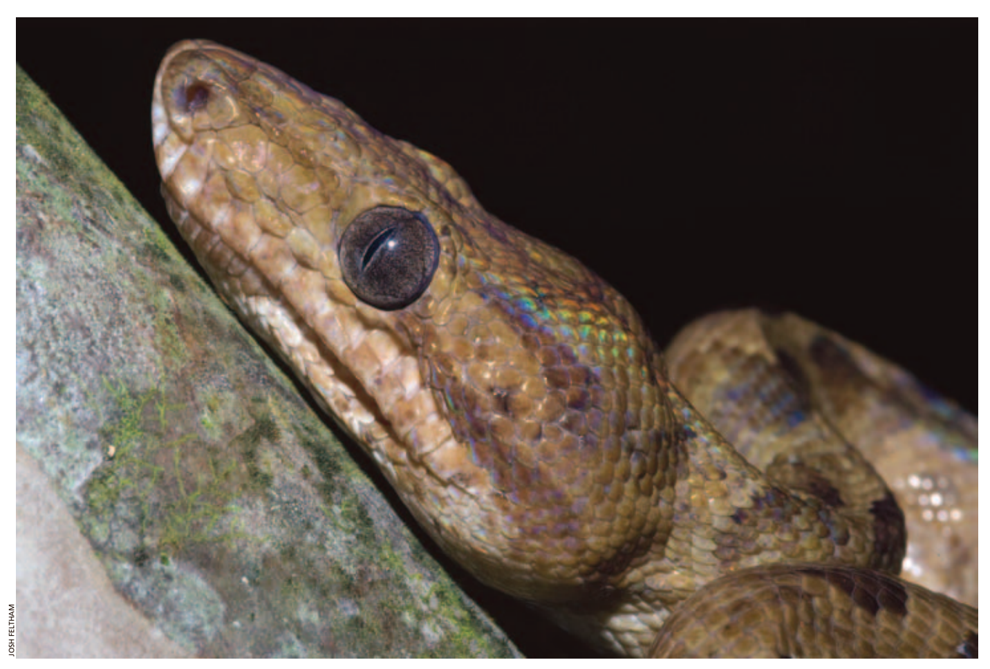
Fig. 3. Corallus annulatus from the Caño Palma Biological Station.