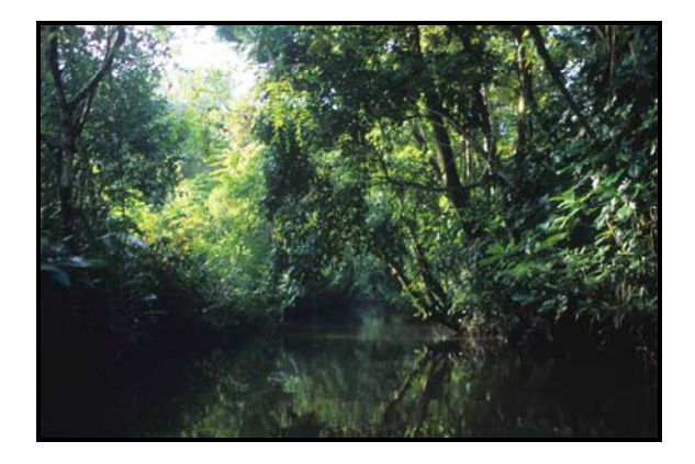
FIGURE 3. Typical habitat of Caiman crocodilus fuscus at Cano Palma, Tortuguero, Costa Rica.

Increasing boat traffic in the region due to increasing ecotourism and a rapidly expanding local community can only increase the vulnerability of this species to injury and population reduction. In addition to increased boat traffic, engine size and boat speed has also increased dramatically. Ten years ago engine size ranged between 5 and 25 HP, whereas currently they are between 150 and 250 HP (Mario Gomez, 2001, pers. comm.). Engine noise has also been reduced greatly in modern 4-stroke engine designs compared to older 2stroke engines, potentially giving C. crocodilus less response time. Often, these waterways are extremely narrow and have frequent bends, giving little time for crocodilians to respond and evade fast-moving boats. Diving into deeper water can be a temporary refuge and vertical avoidance of boats is a strategy employed by