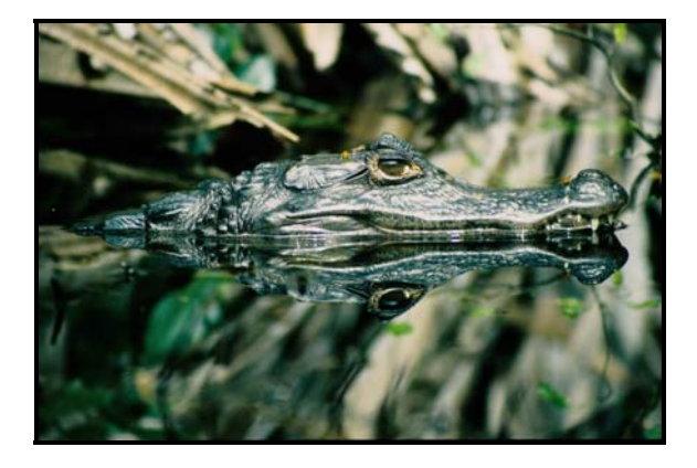
FIGURE 1. Caiman crocodilus fuscus.