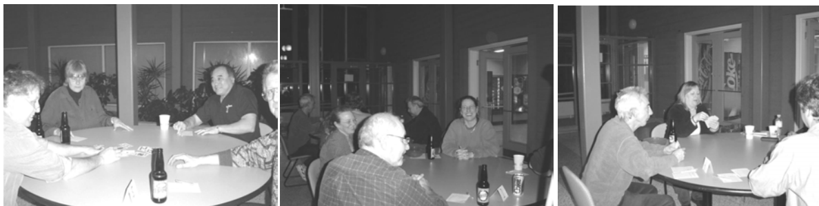
Scenes from Euchre Night March 1, 2006